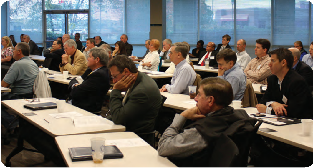
Chattahoochee Basin Advisory Council meeting