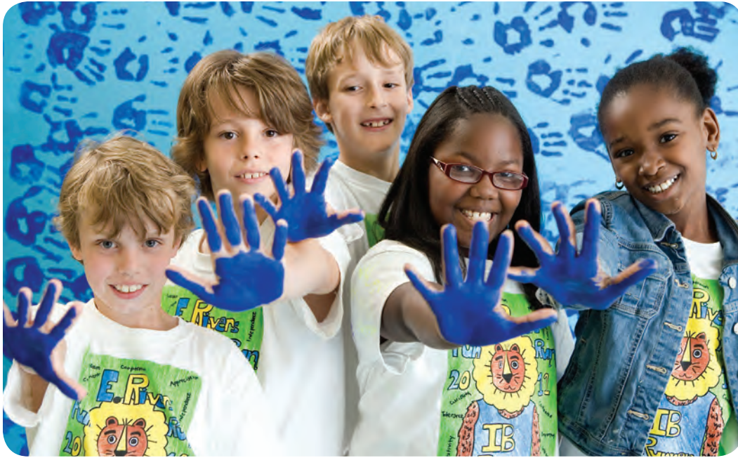
"I'm In" Kickoff at E. Rivers Elementary School

In addition to "I'm In" and the Clean Water Campaign, the Metro Water District produces brochures, videos, posters and how-to booklets to capitalize on economies of scale and ensure consistent messaging throughout the region.