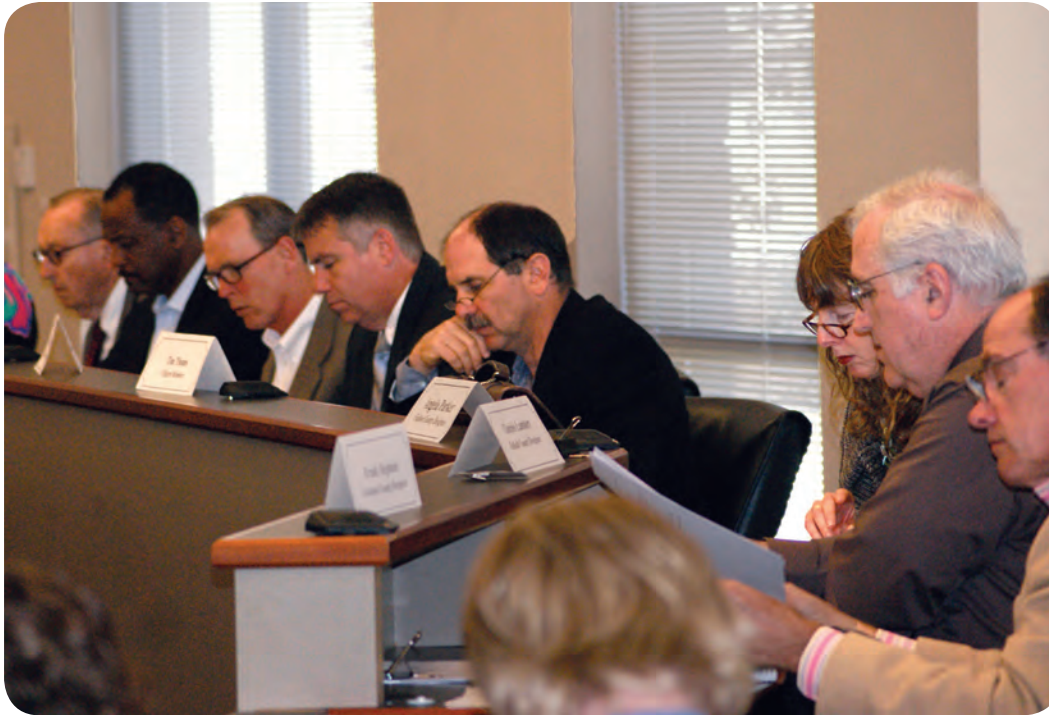
Metropolitan North Georgia Water Planning District Board meeting