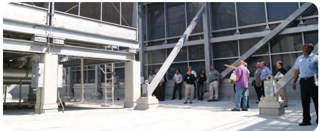
Cooling tower water efficiency training workshop