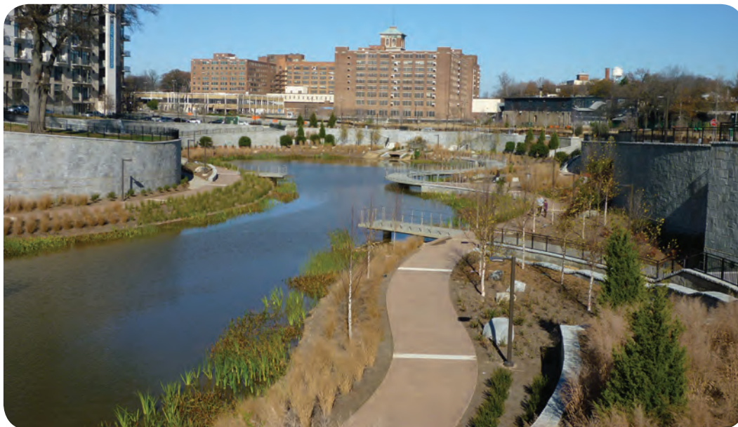
City of Atlanta Historic 4th Ward Park Multi-Purpose Regional Stormwater Facility

The Metro Water District has created a suite of model ordinances intended to address a variety of issues related to the region's water resources. Stormwater management ordinances reduce water pollution and damage to stream banks by requiring all new development to control stormwater runoff. Floodplain ordinances are helping to map future flood-prone areas, which will give homeowners and businesses information they can use to guard against the risks of flooding. Vegetative buffers called for by model stream buffer ordinances protect water quality and stream bank integrity. Pollution is also reduced as a result of illicit discharge ordinances that make it illegal to discharge contaminants to storm drains and provide for appropriate enforcement and remedial actions. As of 2011, 95 of the District's 106 jurisdictions - representing well over 99 percent of the area - have adopted all of the model ordinances.