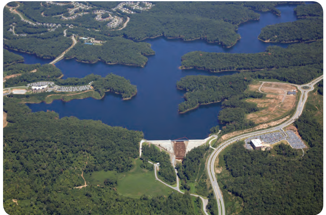
Cobb County-Marietta Water Authority/City of Canton Hickory Log Creek Reservoir

In addition, the Metro Water District encourages water systems to maximize water reuse opportunities. A number of facilities practice non-potable reuse in the form of golf course irrigation, industrial process water and other urban irrigation. Indirect potable reuse is also practiced in Fulton, Gwinnett, Cobb and Clayton counties.