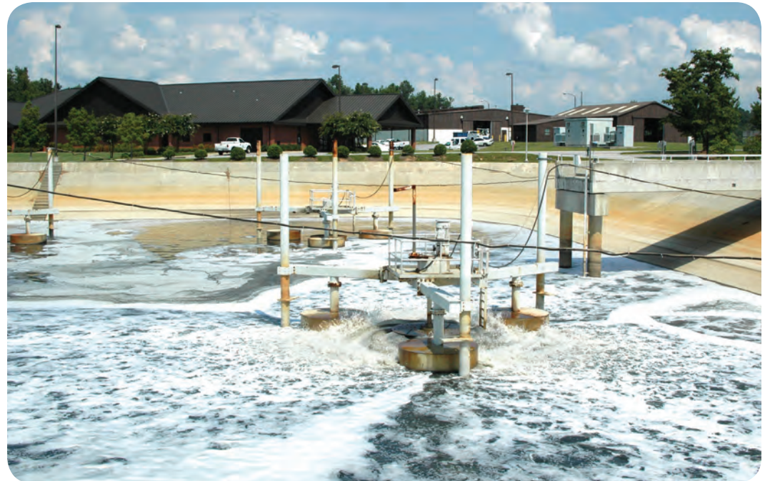
City of Gainesville's Flat Creek Water Reclamation Facility

The plan includes requirements for intensive inspection and maintenance of sanitary sewer systems, improvements in asset management, streamlining of tasks through the development of standardized procedures and more comprehensive management of onsite wastewater management systems. These wastewater management measures are necessary to ensure that the sanitary sewer system operates properly and that public health is protected.